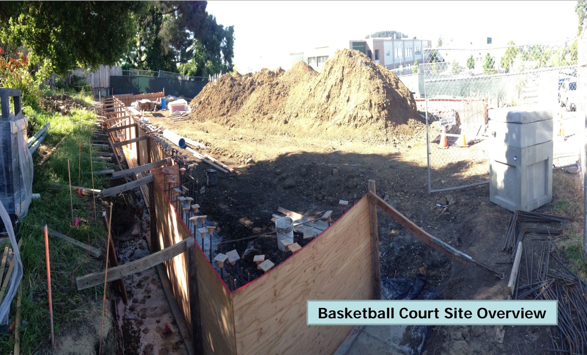
Basketball Court Site Overview

Contract Value: $13,438,000 Change Order: 6.98%