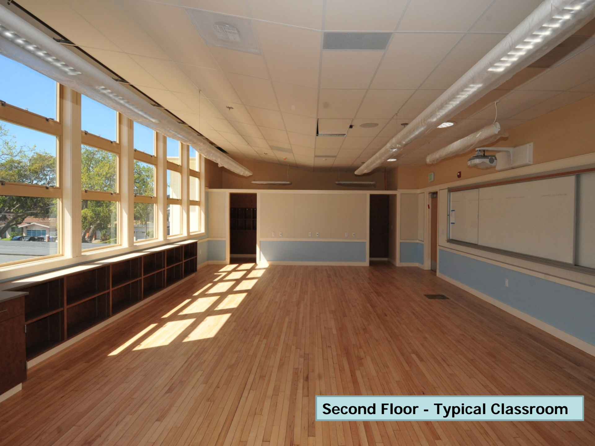
Second Floor - Typical Classroom