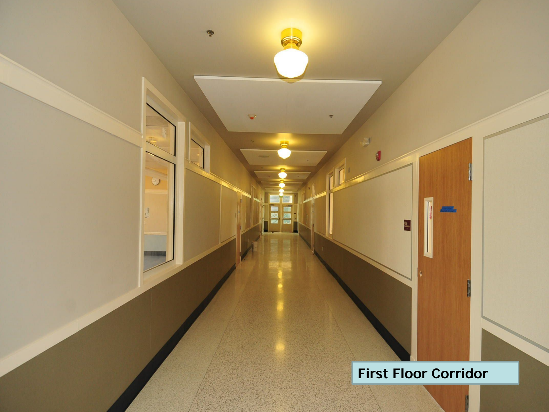
First Floor Corridor